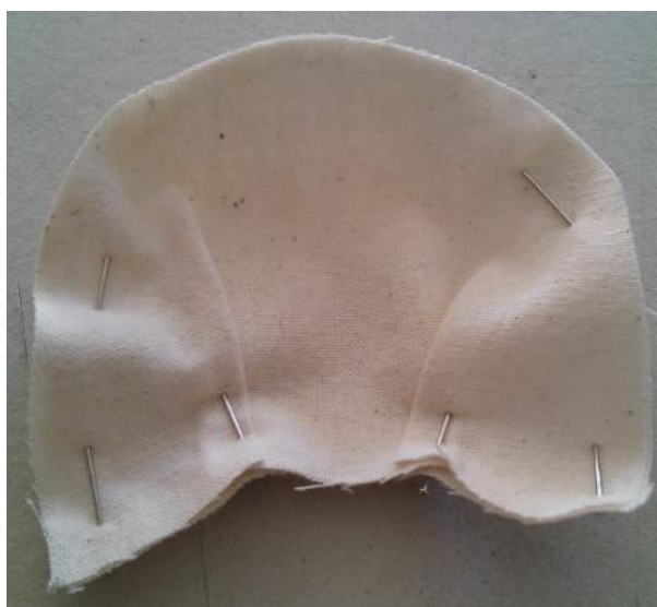
Lining Fabric view

Stitch along the top edge to hold these pleats in place.