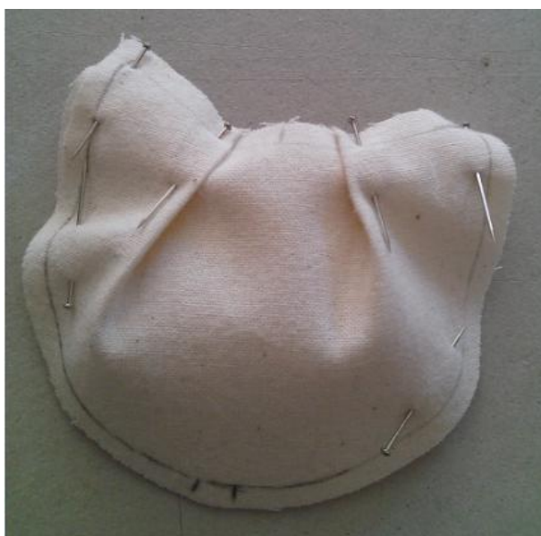
Outer Fabric view